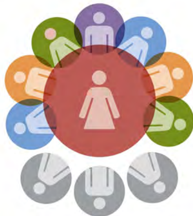
70% of event attendees followed up with somebody they met there.