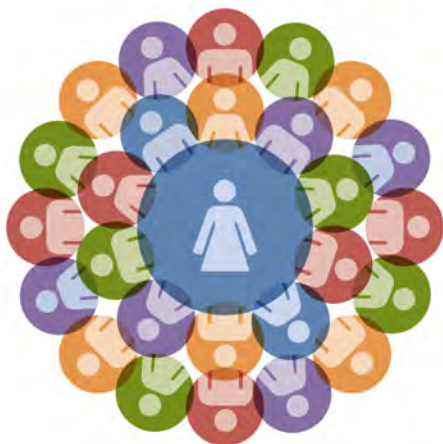
Participants connect with 26 people, on average, through NGCP.

NGCP participants are most commonly from informal education, K-12, or higher education, but others represent businesses, professional organizations, and government.