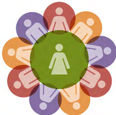
Attendees meet an average of 9 new people at NGCP events.